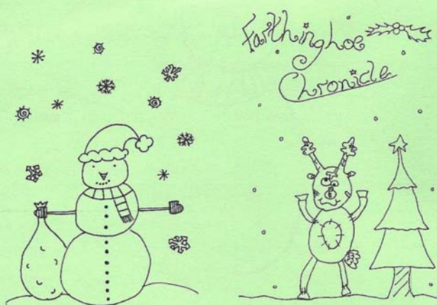
2nd Place Beth Ellison