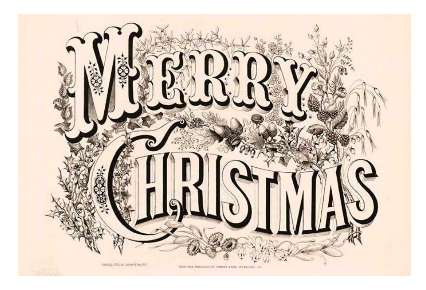
And a happy New Year to all in Farthinghoe and Steane...